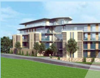
GARDEN SPACE (VALIMMO PROMOTION) business offices spread over 3 buildings (8,200 sqm)