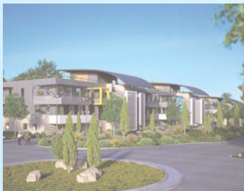
FAIRWAY (NEXITY/STENA REALTY) business offices spread over 4 buildings (5,000 sqm)