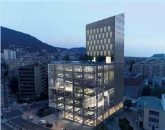
EUROPEAN CITY OF HEALTH INNOVATION emblematic building (7,000 sqm)