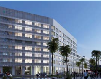
CONNEXIO business offices (11,500 sqm)