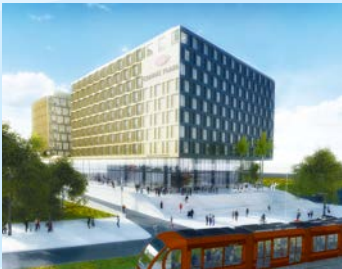
UNITY business offices & retail with 2 hotels (20,500 sqm)