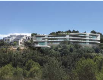
BELVEDERE (VALIMMO PROMOTION) business offices spread over 1 building (3,700 sqm)