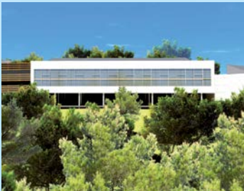
LES ARCANES (SERCIB) business offices spread over 3 buildings (8,500 sqm)