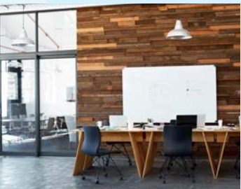
PÔLE DE L'INNOVATION Innovation Center (10,000 sqm)