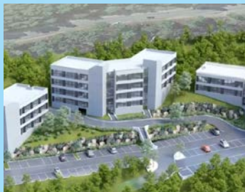
NOVA SOPHIA (COURTIN REAL ESTATE) business offices spread over 3 buildings (6,500 sqm)