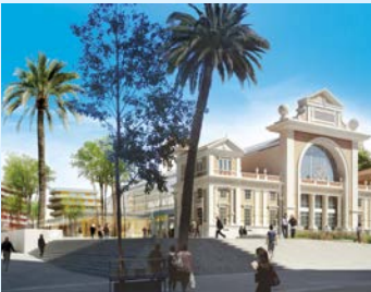
GARE DU SUD mixed-use development (25,600 sqm)