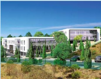
ARTEPARC SOPHIA (ARTÉA) business offices spread over 2 buildings (4,350 sqm)