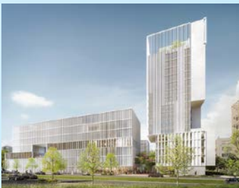
CAMPUS SUD DES MÉTIERS education facilities and student accommodations (24,000 sqm)