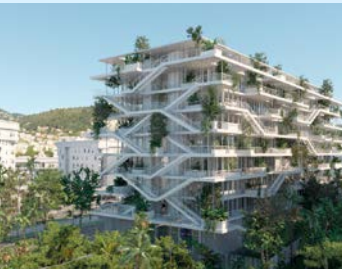
ANIS business office concept (6,700 sqm)