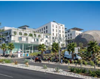
PASTEUR 2 CHU Pasteur 2 (81,000 sqm)