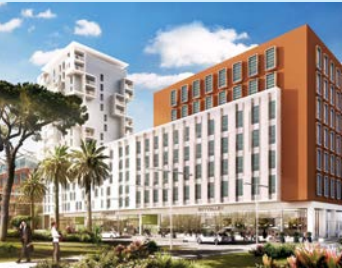
SKY VALLEY offices and retail (3,600 sqm)