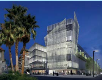
LA VILLETTE mixed-use development (40,000 sqm)