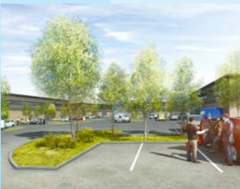
LE ROGUEZ business park for industrial activities (15,000 sqm)