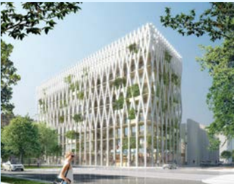
PALAZZO business offices (7,900 sqm)