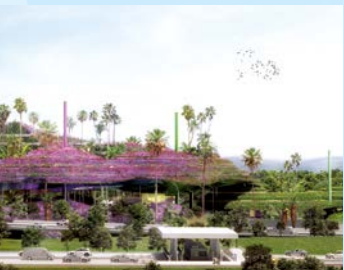
ECOTONE (CIE DE PHALSBURG) business offices, hotel and services (40,000 sqm)