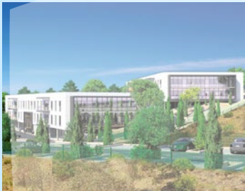
ARTEPARC SOPHIA (ARTÉA) business offices spread over 1 building (2,150 sqm)