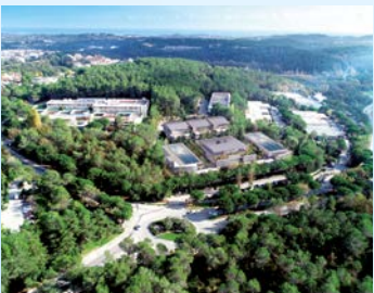
CENTRIUM (COURTIN REAL ESTATE) business offices, retail & services spread over 4 buildings (14,500 sqm)