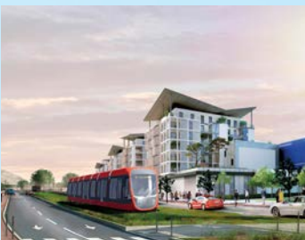
ÉCO QUARTIER ST-ISIDORE mixed-use development incl. IKEA (55,000 sqm)