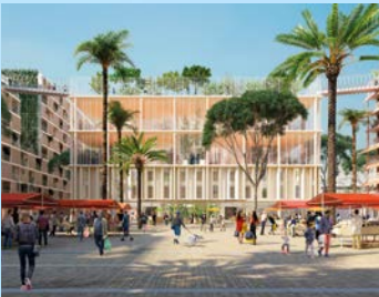
JOIA MERIDIA housing and retail (73,500 sqm)