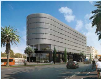
NEO mixed-use development and hotel (13,600 sqm)