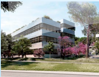
SKY SOPHIA (LAZARD) business offices spread over 2 buildings (9,500 sqm)