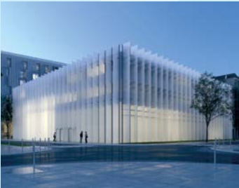
IMREDD : Mediterranean Institute of Risk, Environment and Sustainable Development (5,000 sqm)