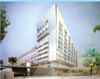
GRAND CENTRAL mixed-use development with student accommodations (35,000 sqm)