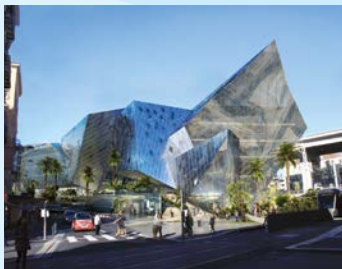
ICONIC (GARE THIERS) retail park mixed-use with hotel & restaurants (18,300 sqm)