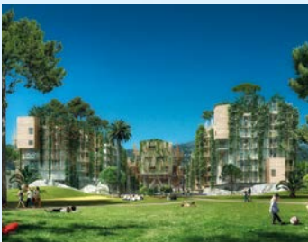
ÉCO QUARTIER LE RAY mixed-use development with sports facilities (28,000 sqm) and urban park (2,8 ha)