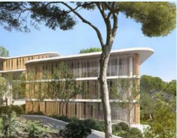
NATURAE (COURTIN REAL ESTATE) business offices spread over 2 buildings (6,250 sqm)