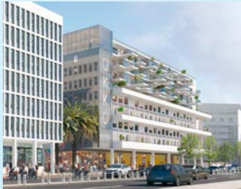
NOUVEL'R : business offices, residential, student and tourism accommodations, retail (29,000 sqm)