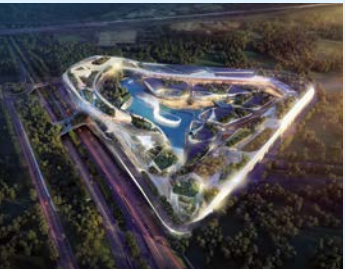
LES CLAUSSONNES (CIE DE PHALSBURG) business offices, hotel, retail & services (100,000 sqm)