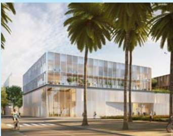
INPHYNI : Nice Physics Institute - labs, education facilities (6,500 sqm)