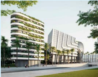
AIR PROMENADE mixed-use development and hotels (25,000 sqm)